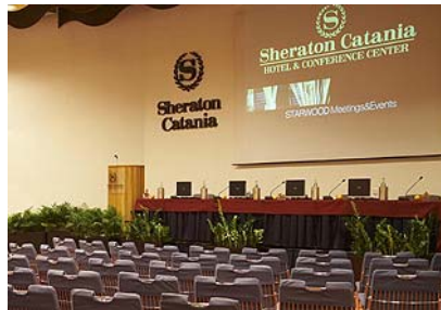
Sheraton Conference Center

IADAT-elec2007 International Conference on Electrical and Electronics Engineering will be held in Catania (Sicily-ITALY) from September 27 th to September 29 th ,2007; at the Sheraton Conference Center